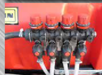
Venturi Nozzle Metering Valves