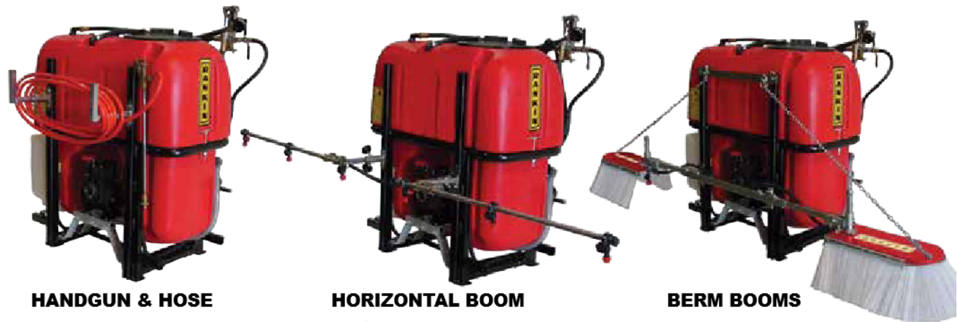
HANDGUN & HOSE