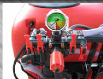
Pressure Regulator Valve with Manual Controls

Our COMPACT VENTURI SPRAYERS feature the latest technology in low volume spraying. This method results in considerable savings in time due to the reduction in the quantity of water required, which results in fewer fill ups and will spray 2 to 4 times longer than air blast sprayers of the same tank size. Venturi distribution heads produce 50 micron fog size droplets which adhere to the plant surface and deposit the chemical on the foliage instead of dripping and running off on the ground. Nozzles adjust to direct spray only on the crop which results in less chemical waste and soil or water contamination.