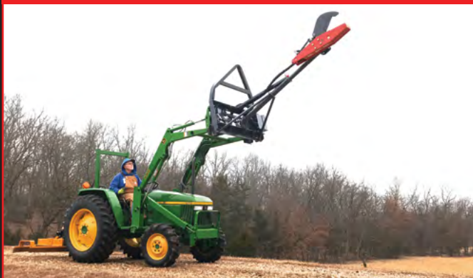
MC7551 - Extended 8 ft