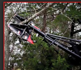
Power Rotate to Trim Limbs