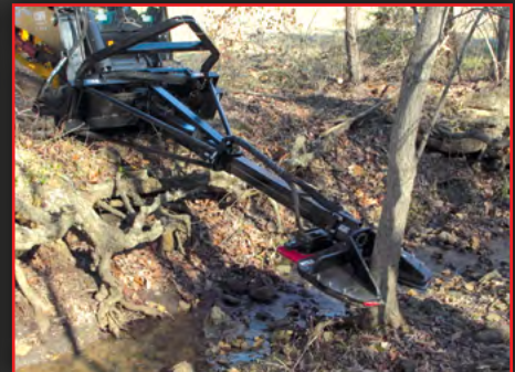
Long Reach for Ditches & Creek Beds