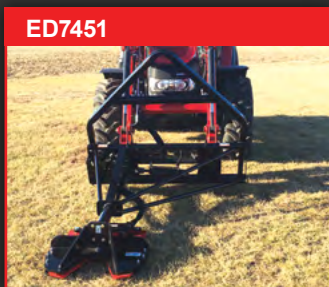
Offset Tractor Mount