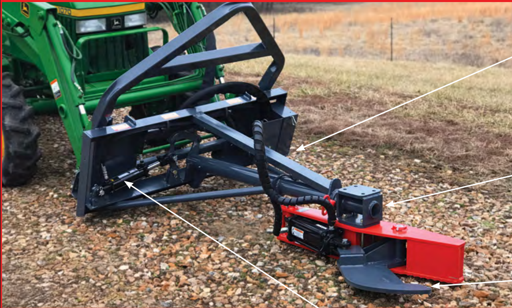
MC7551 - Adds Auxiliary Hydraulics to Tractor

Finally, A Tree Shear For Smaller Equipment!