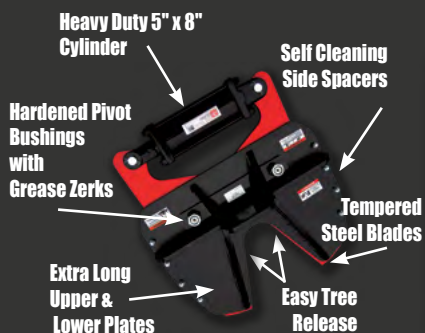
664000 Clipper Head