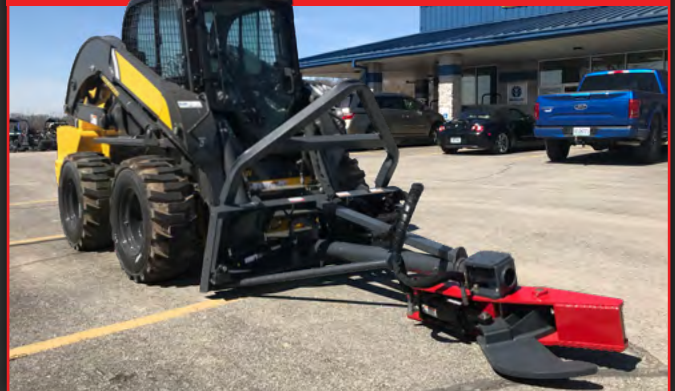
Wireless Remote Included

Skid Steers & Tractors with Auxiliary Hydraulics