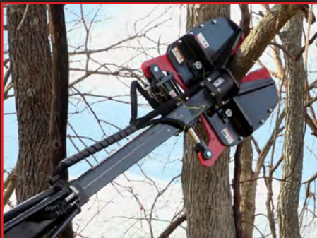
Cut Hard to Reach Areas