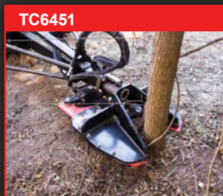
Clean Fence Rows