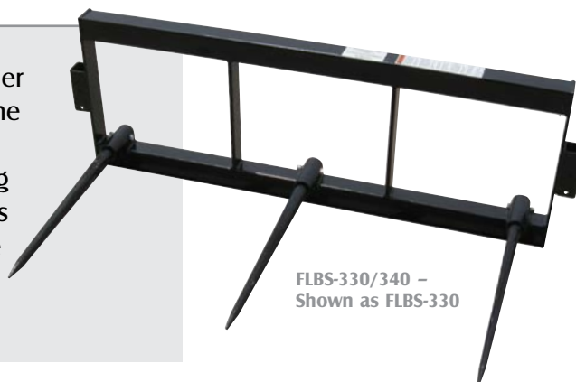
FLBS-330/340 – Shown as FLBS-330

Handling large or mid-size rectangular bales is easier using one of our 3 or 4 spear models to perform the job. All models feature tapered “forged” spring steel spears. Optional pin-on brackets or interfacing brackets for most popular quick-attach front loaders are available. Select models are convertible for use on a 3-pt. hitch with the addition of the optional bolt-on ear assembly (not Quick Hitch adaptable).