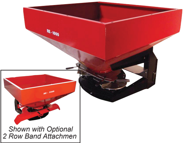
Shown with Optional 2 Row Band Attachmen

RE SERIES SPREADERS feature twin stainless steel spinner discs which are extremely accurate with only 6.7% variance across the spread pattern. The spreader has dual levers to set the pounds per acre and hydraulic cylinder for off and on. The lever allows for easily setting the spreader for 180°, 90°