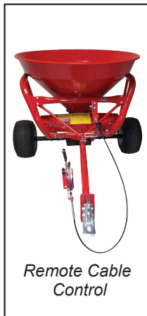
Remote Cable Control