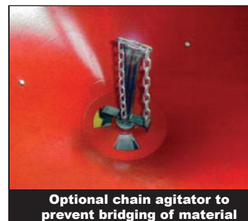
Optional chain agitator to prevent bridging of material

Specifications subject to change without notice