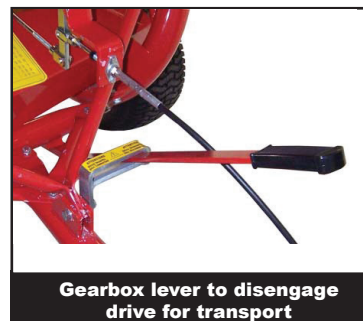
Gearbox lever to disengage drive for transport

PTB SERIES SPREADERS are a self contained, towable implement that can be operated by almost any vehicle. This unit has a ground driven, cast iron, oil bath gearbox that can be disengaged when transporting. It is ideal for spreading seed, fertilizer, sand, and salt. The large 20" diameter x 10" wide tires make this a "Turf Friendly" implement. The spreader features a cable control that allows the operator to adjust spread rate and turn the spreader on and off from the vehicle seat. This is a popular, low cost spreader for golf courses, parks, sports fields, and turf farms.