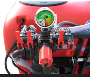
Pressure Regulator Valve with Manual Controls