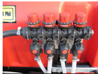
Venturi Nozzle Metering Valves