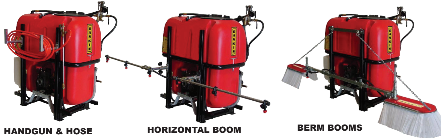
HANDGUN & HOSE