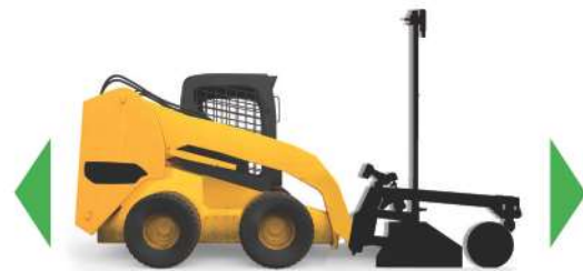
Grades in both directions to help optimize productivity

The unique frame design gives operators exceptional control, efficiency and smoothness, and eliminates the "bounce" effect common in skid steer loaders due to the short wheelbase.