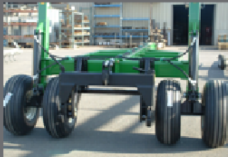
Requires Cat. 3 Narrow Quick Hitch