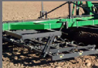
3 Row S-Tine Attachment