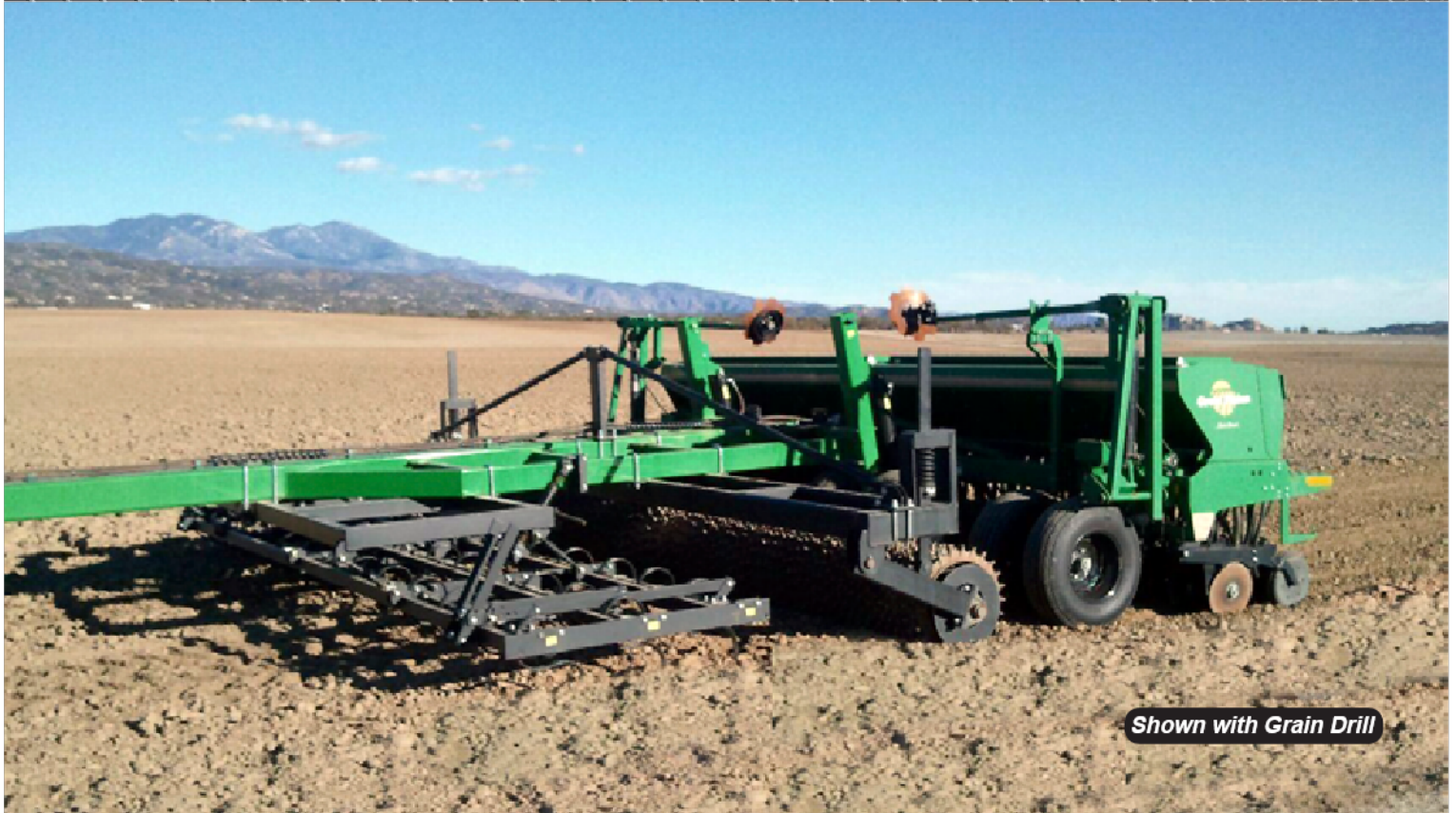
Shown with Grain Drill

Assists in One Pass Tillage, Packing & Planting