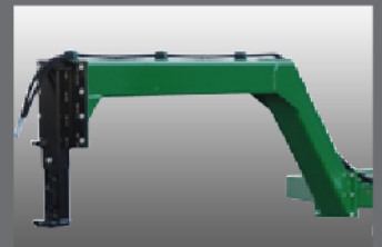
Optional Gooseneck Hitch for TSP-2040 & TSP-2041