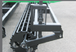
24" Diameter Bar Roller Packer