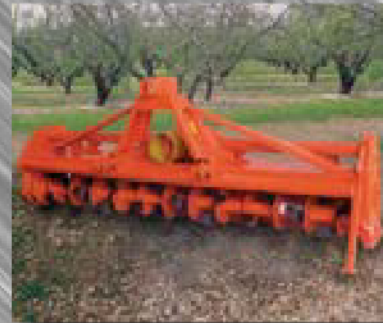
RG Tiller with Adjustable Rear Roller

An important application for these tillers with rear rollers is to bury wood chips by tilling 2 to 3 inches deep. The roller then slightly compacts and smooths out the orchard floor. The wood chips will decompose at a faster rate and the rolled out area is then in better condition for the harvesters. The University of California Cooperative extension recommends keeping wood chips and shavings in the orchards. They also stated that if well managed, prunings can become a source of organic matter and nutrients in the soil.