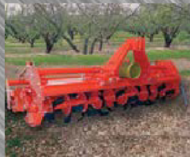
SPR Tiller with Adjustable Rear Roller