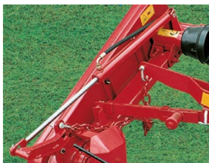
Hydraulic Lift Kit (optional).

The SITREX Sickle bar Mower Series SB is a simple and reliable machine. Three working widths are available: 165 cm (5' 6") 180 cm (6') and 210 cm (7') to satisfy the requirements of small and medium size farms. The mower is normally supplied with manual lift of the mowing unit. Upon request an hydraulic lift kit can be supplied.