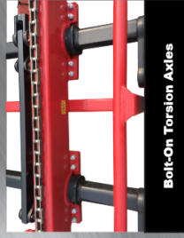
Bolt-On Torsion Axles