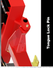
Tongue Lock Pin