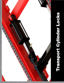
Transport Cylinder Locks