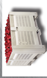
Handles Plastic and Wood Bins