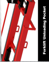
Forklift Unloading Pocket