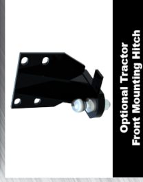
Optional Tractor Front Mounting Hitch

Protect Your Fruit & Increase Productivity