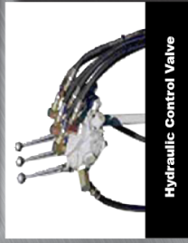
Hydraulic Control Valve