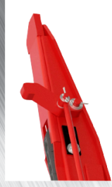
Mechanical Bin Stop