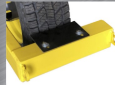
Tire Scraper Standard