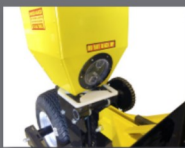
Removable Sight Glass