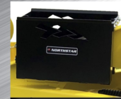
Weight Box Standard