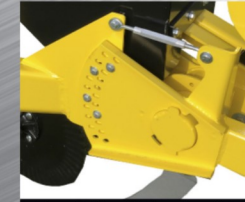
Eze-Adjust Turnbuckle System