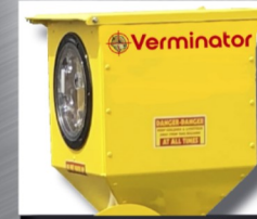
Large Removable Sight Glass