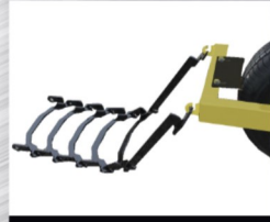
Drag Chain Optional