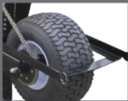
Tire Scraper Optional