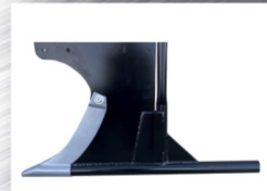
HD Parabolic Shank w/ Hardened Alloy Point