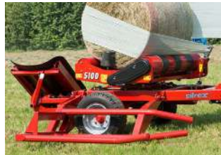
Adjustable loading fork