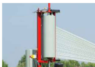
Film stretcher 75-50 cm