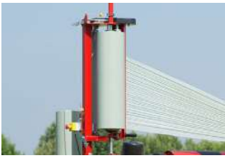
Film stretcher 75-50 cm