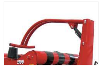
Central loading fork