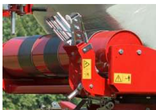
Automatic reset of the cutting system