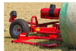
Adjustable loading fork