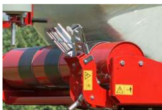
Automatic reset of the cutting system