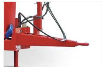
Adjustable draw bar