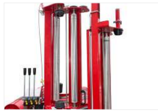
Aluminium film-stretcher dispenser