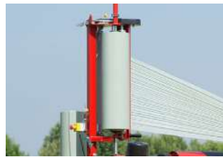
Film stretcher 75-50 cm