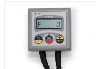
Electronic rev counter