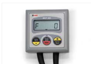
Electronic rev counter