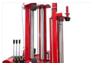
Aluminium film-stretcher dispenser