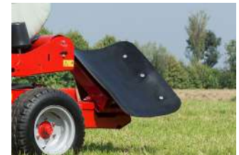
Rear platform to unload bale or vertical overturning