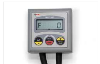
Electronic rev counter