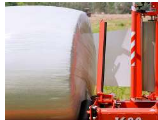
Hydraulic cutting mechanism