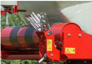
Automatic reset of the cutting system