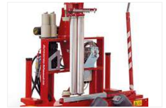
Aluminium film-stretcher dispenser