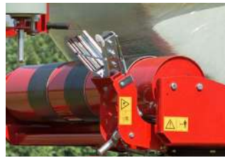
Automatic reset of the cutting system