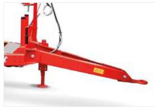
Adjustable draw bar