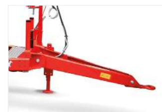
Adjustable draw bar