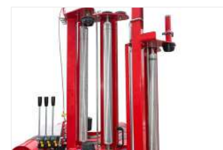
Aluminium film-stretcher dispenser