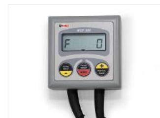
Electronic rev counter