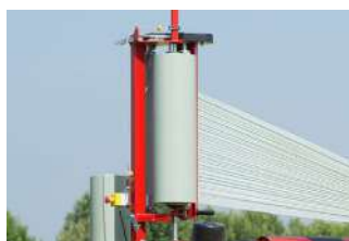
Film stretcher 75-50 cm