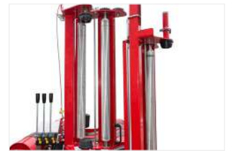
Aluminium film-stretcher dispenser