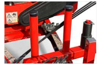
2 reel supports